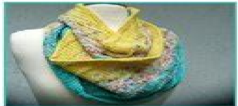
Color A - "Sunflower" Color B - "Ty Dy 2.0" Color C - "Aqua"

Holding two strands of color A together, cast on 211 stitches. Join in the round, being careful not to twist the stitches. Place marker at beginning of round. As you proceed through the pattern, you will change colors every nine rows . Beginning with row 10, you will be knitting with one strand of color A and one strand of color B. Beginning with row 19, you will be knitting with two strands of color B. Beginning with row 28, you will be knitting with one strand of color B and one strand of color C. Beginning with row 37, you will be knitting with two strands of color C.