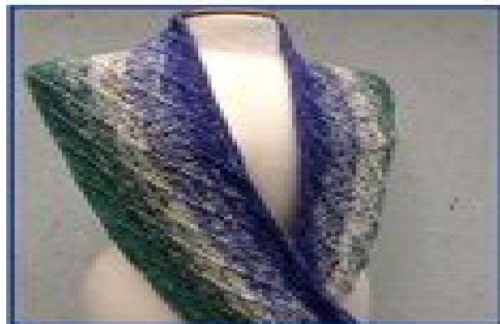
Color A - "Blue Velvet" Color B - "Auntie's Journey" Color C - "Forest"

Row counter, stitch marker Tapestry needle