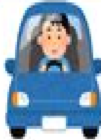
Driving a Car