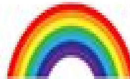
Seeing a Rainbow