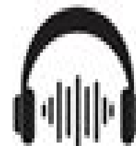
Sound Waves and Music