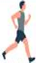
Walking or Running