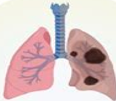
Conventional Therapies of Lung Cancer