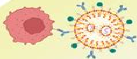
Immune checkpoint inhibitors