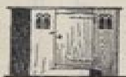
LATE 15th CENTURY Gothic