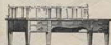
ABOUT 1795 Sheraton