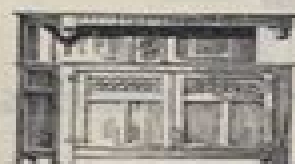
MID 17th CENTURY Jacobean