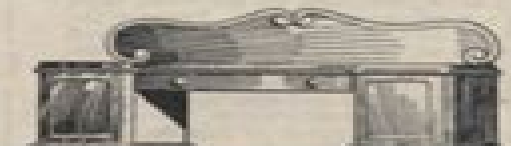
MID 19th CENTURY Victorian