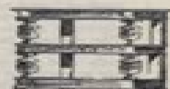
2ND HALF 16th CENTURY Elizabethan