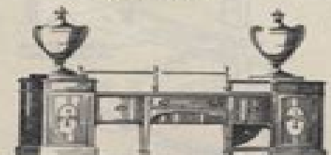
ABOUT 1785 Hepplewhite