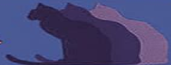
So Many Cats