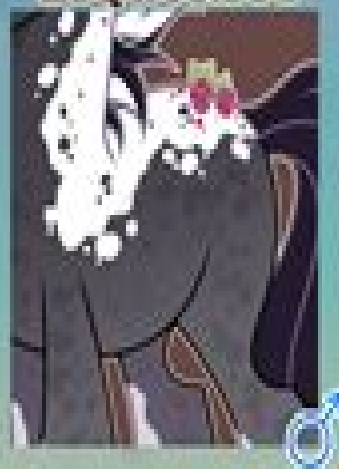
2. RASPBERRY LIQUORICE