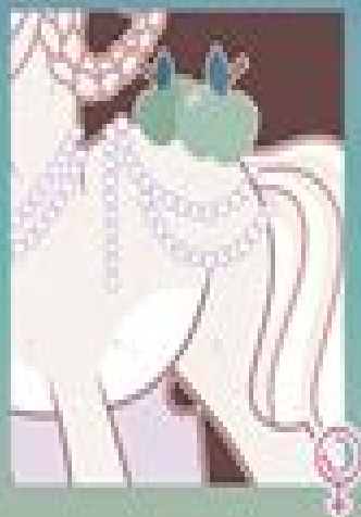
1. MILK APPLE