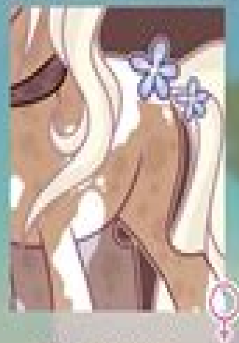
3. AZURE BLOSS