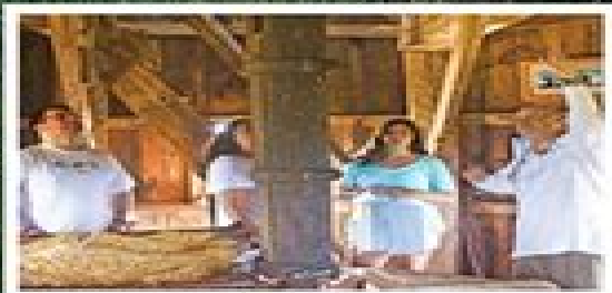
Celebrating the Old Mill... see page 4