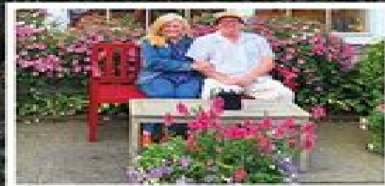
The Cowryfakes... see page 28