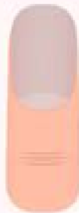
Nails Of Hippocrates