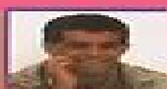
Your Wife's Friend