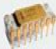
Intel 4004 (1971)

2300 transistors & capability of 92000 operations per second