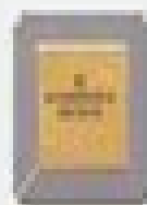
Motorola 68000 (1979)

2300 transistors & capability of 92000 operations per second