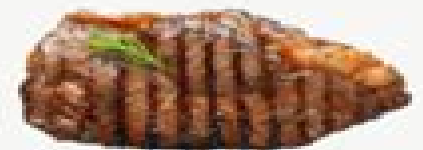
sirloin steak (55%)