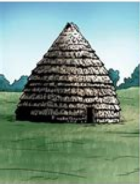
Grass House Kadawdaachuh