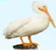
American White Pelican