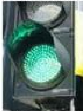
LED traffic lights