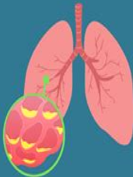
Squamous Cell Carcinoma