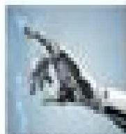
Robotics and Prototyping