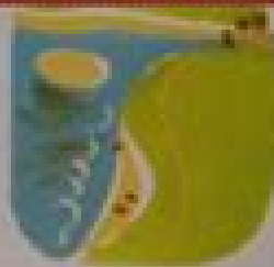
ski (page 3)