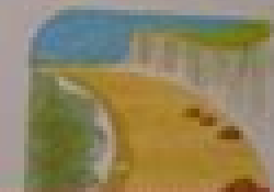
rocks (page 4)