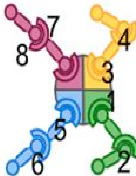
(d) 4-Agent Ant [4x2]