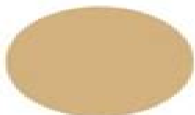
Warm Butterscotch (DE6151)