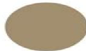
Tuscan Mosaic (DE6208)