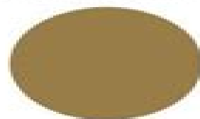
Alluring Umber (DEC730)