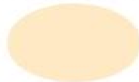
Spanish White (DEC724)