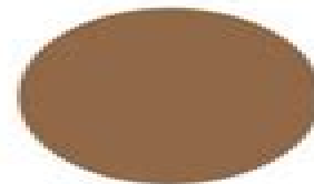
Cedar Chest (DE6112)