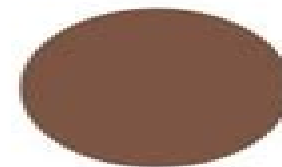
Rox Brown (DE6084)