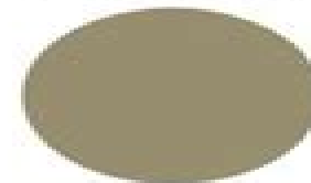
Courtyard Green (DEC776)