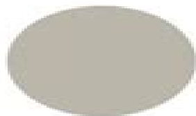
Play on Gray (DE6228)