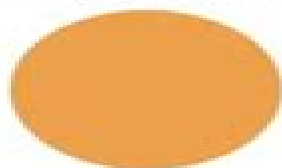
Pumpkin Pie (DE5228)