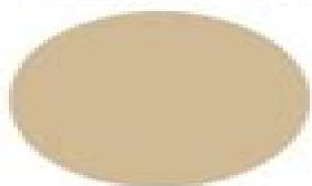
High Noon (DEC743)