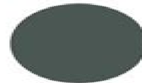
Black Spruce (DE6308)