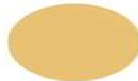
Deserted Path (DE5367)