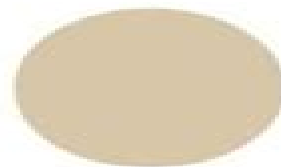
Pale Beach (DE6199)