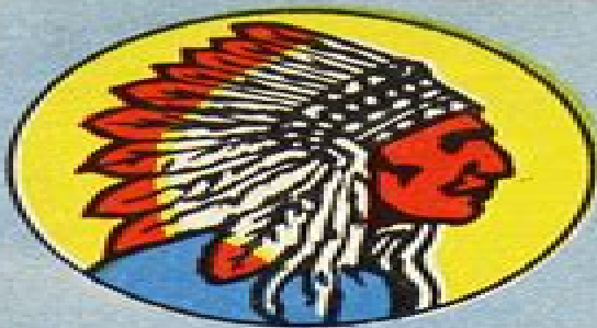
ED MATHEWS third base MILWAUKEE BRAVES