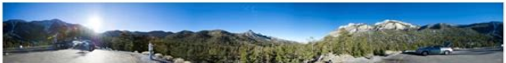
Mt. Charleston, Nevada, USA