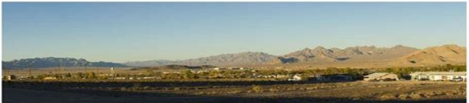
Indian Springs, Nevada, USA