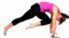
Knee to nose