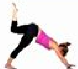
Knee circles (step 2)