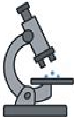
Optical and Electron Microscopy