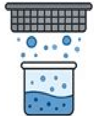
Sieving and Sedimentation