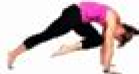
Knee to nose