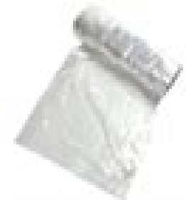
Dry cleaning bags