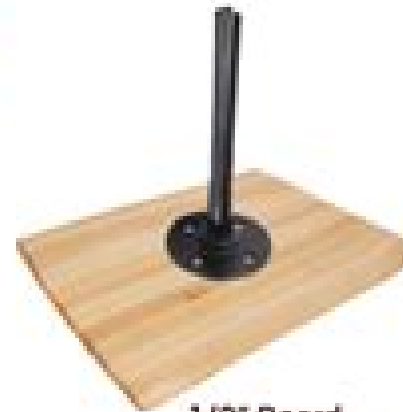
1/2" Board 1/2" flange & pipe