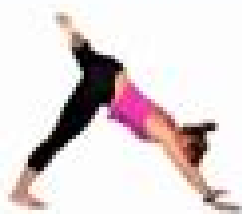
Knee circles (step 1)