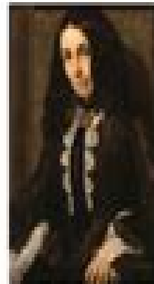
Elizabeth Barrett Browning