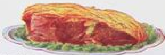
Roast Mutton of Joint. Carving of Mutton. Roast Beef of Joint.