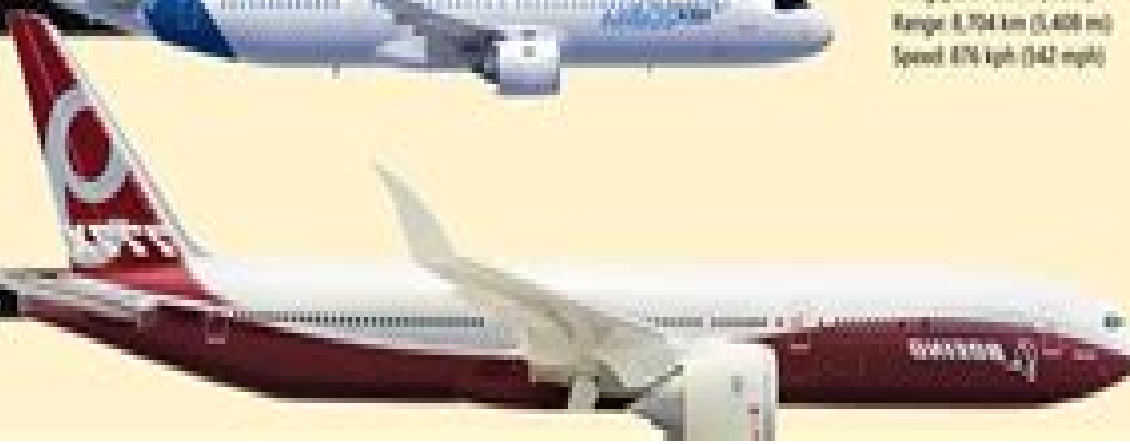
05. BOEING 777-300ER

Year: 2025 Capacity: 384-426 Passengers Length: ~74 m (243 ft) Wingspan: ~71.7 m (235 ft) Range: ~13,500 km (8,398 mi) Speed: 1,037 kph (644 mph)