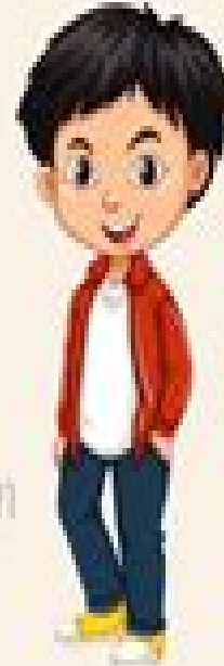
Concrete Operational Stage