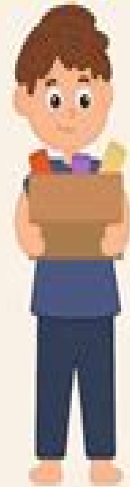
Formal Operational Stage

Boosting logic with hands-on learning in autism.