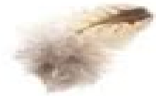
Facial Disc Feathers