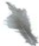
Facial Disc Feathers