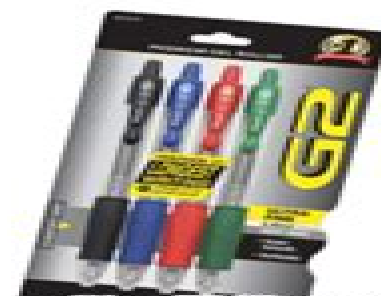
The BEST pens