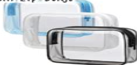
Small Zip Bags