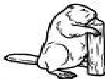
State Animal: American Beaver