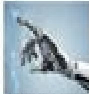
Robotics and Prototyping