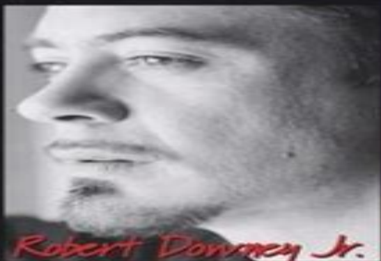
Robert Downey Jr.