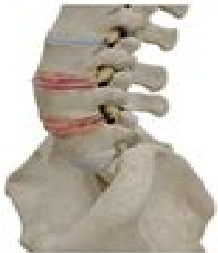
Degenerative disc disease