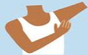
Loss of armpit and pubic hair