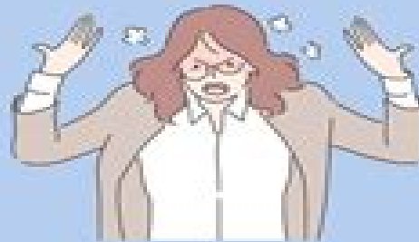
Anger and irritability