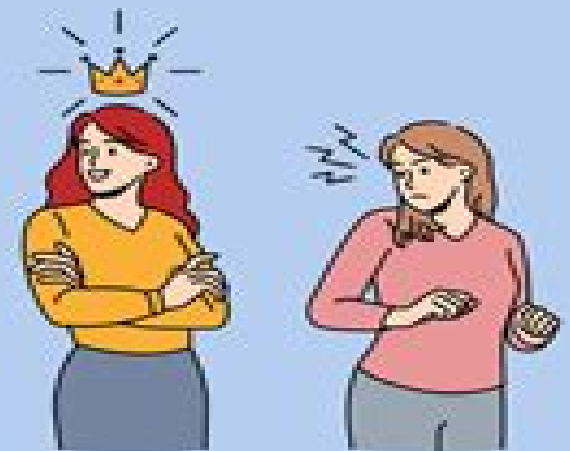
Jealousy and feelings of envy