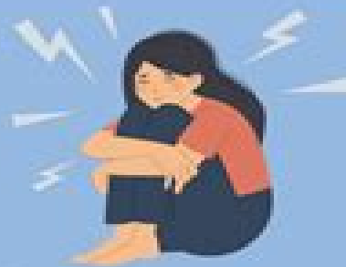
Extreme worry or anxiety