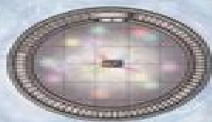
CENTRAL TOWER, FOURTH FLOOR