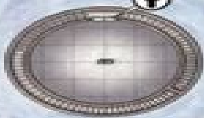
CENTRAL TOWER, THIRD FLOOR