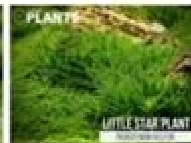
LITTLE STAR PLANT