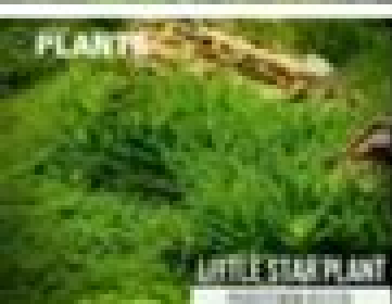
LITTLE STAR PLANT