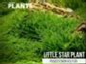
LITTLE STAR PLANT