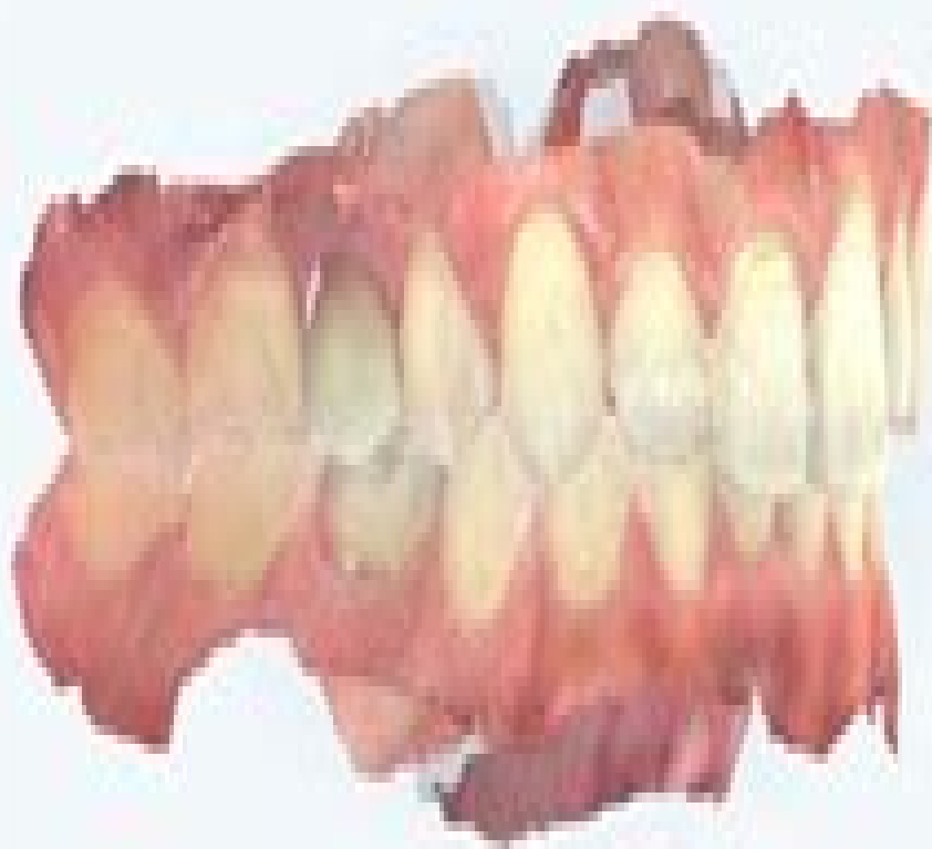
Before using OTC Night Guard