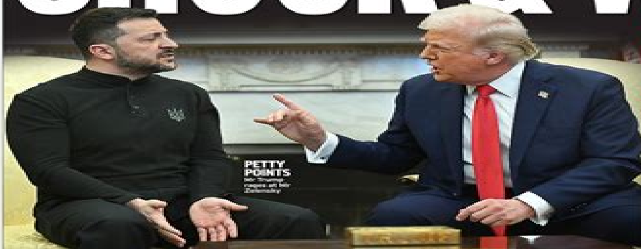
PETTY POINTS Mr. Trump plays at Mr. Zelenskyy

» Trump stuns world with vile rant at Zelenskyy » Ukraine hero is forced home without a deal