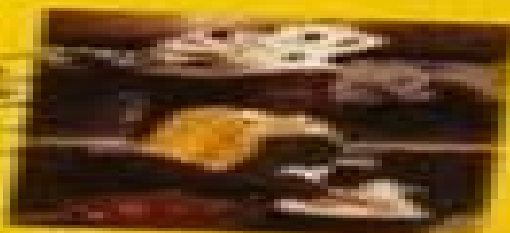
Over the Rainbow