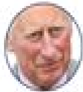
King Charles III