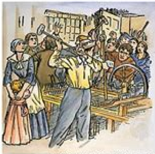
Luddites smashing looms in a factory during the riots of 1811-16.