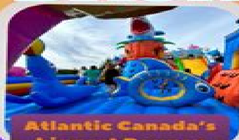
Atlantic Canada's biggest Bouncy Castles