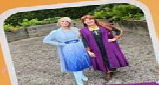
Your favorite Princesses