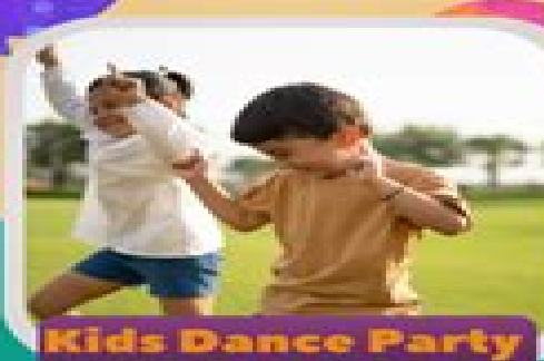
Kids Dance Party with DJ