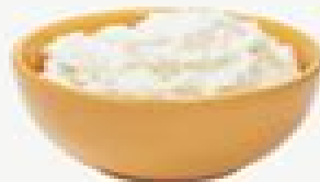
cottage cheese (65%)