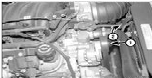
24.11 To remove the drivebelt, rotate the tensioner bolt (1), clockwise (2) to relieve belt tension (2007)