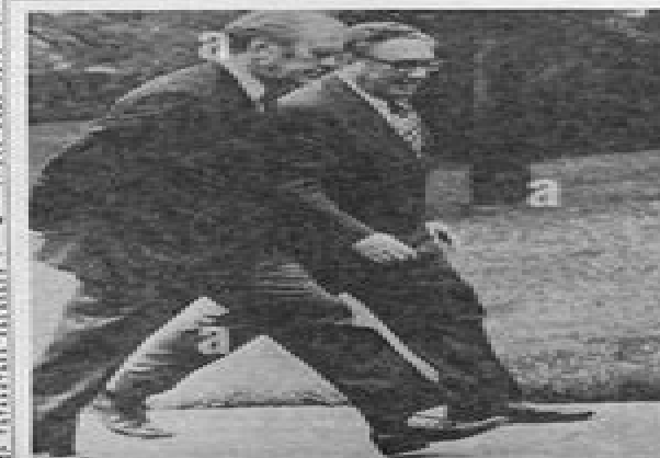
A group of men in suits are walking together. One man is in the foreground, looking down, while others are behind him.

The general said that the war was over and that the troops should return to their homes. He urged the troops to lay down their arms and to return to their families.