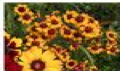
Coreopsis (state wildflower)